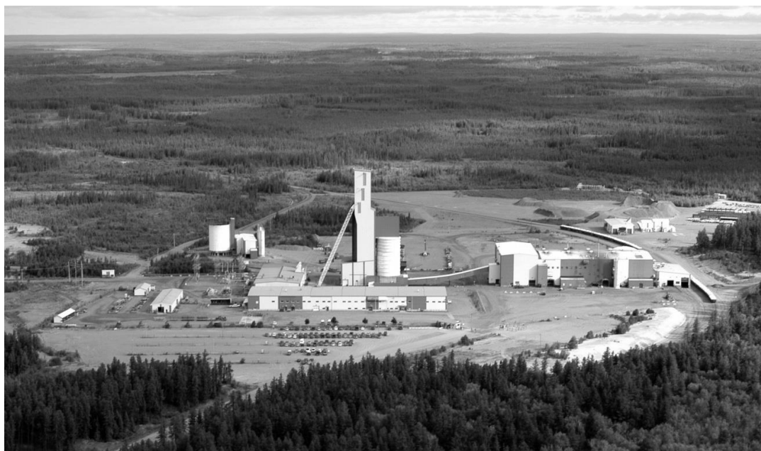
Figure 1 View of the mine site in 2004, before closure (looking north)

At the mine site (Figure 1), the major components were: the concentrator, the production shaft and ore storage bin, the conveyor, the ventilation shaft, the exhaust raise, the office, warehouse and maintenance shops building, the hoist room, the paste backfill plant, the service railroads and rail spur, the electrical sub-station, and the waste rock storage area.