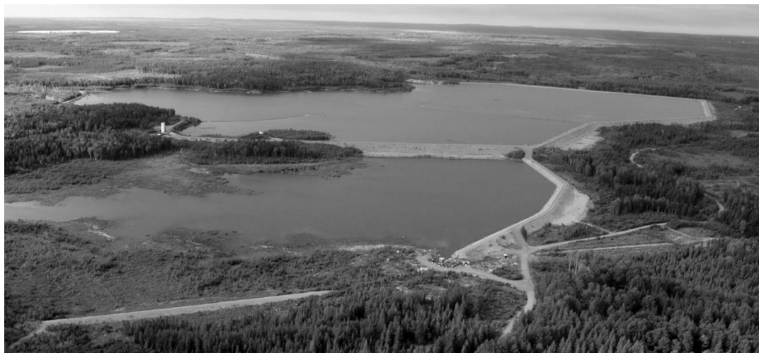
Figure 2 View of the tailings pond infrastructure in 2004 (looking southwest)

Initial investment for construction of the tailings facility was C$ 10,000,000. Figure 2 shows the infrastructure, with the tailings pond in the background and the polishing pond in the foreground.