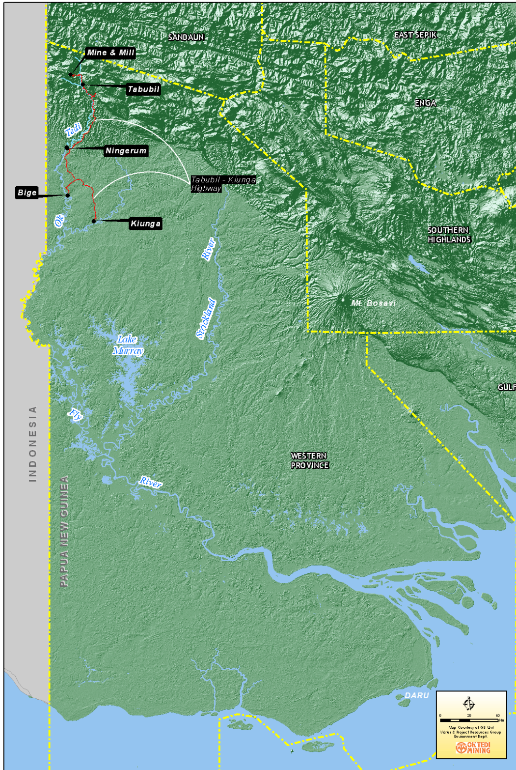
Figure 2 The Ok Tedi project site in relation to the Western Province

The Fly basin has a humid tropical climate and average rainfall varies with elevation (Moi et al., 2001). Rainfall excess of 10,000 mm/year occur at the Ok Tedi mine site (1,500–2,000 masl) and decline to about 8,000 mm/year along the upper and middle Ok Tedi.