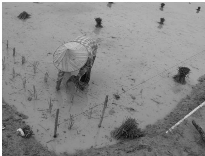
Figure 3 Planting rice seedlings

Seeds of IR64 rice were germinated in a nursery and then seedlings were planted into the plots, spaced at a distance of 30 cm (Figure 3). The plants were watered through 12.5 cm PVC pipes using water extracted from a previous mining pond ('kolong') mixed with cow urine collected from the barn, and from nearby a closed previous mined pond. The water quality analysis of four previous mining ponds showed undetected Pb, Cd and Sn concentrations and about 0.010–0.085 mg/L Cu. Fertiliser applications were made (average use of fertiliser per plot per season of about 105–110 days was 7 kg urea and 3 kg KCl). Four to five insecticide applications were made to each plot over the growing season.