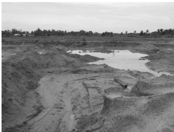
Figure 2 Previously tin-mined land in a rice field area

Studies show that some efforts to restore previously tin-mined lands face significant challenges. Reliance on natural succession to restore sand tin tailings without any human intervention will take a long time before an effective cover is established (Mitchell, 1959; Ang, 1994; Nurtjahya et al., 2007b). Studies of natural regeneration showed that the dominant species, up to 11 years after mining, belong to the families Cyperaceae and Poaceae , while shrub species are common after 40 years (Nurtjahya et al., 2007b). The slow process of natural colonisation results from the degraded physical and chemical soil properties. The texture of mined land is usually sandy and is low in organic matter content, cation-exchange capacity (CEC) and hence exchangeable cations (Nurtjahya et al., 2007b). Research on soil amendments has been performed by using various sources of organic and inorganic materials (Siagian and Harahap, 1981; Puryanto, 1983; Sastrodihardjo, 1990; Naning et al., 1999; Nurtjahya, 2001), including the application of arbuscular mycorrhizal fungi.