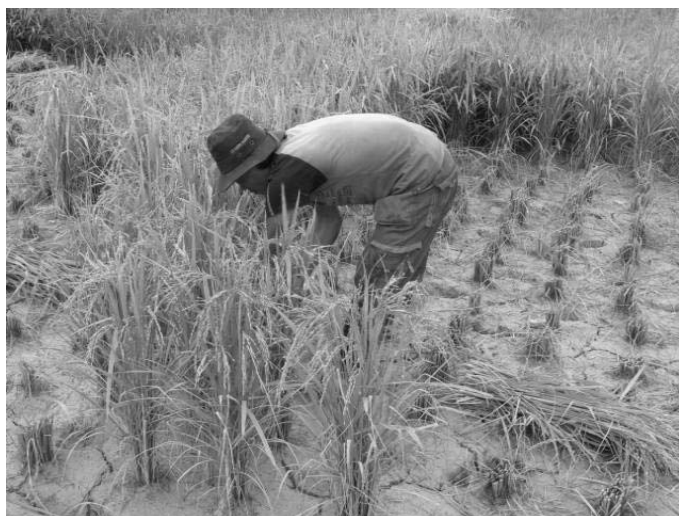
Figure 4 Harvesting rice from the clay sandy soil

After 105–110 days, rice grain was manually harvested (Figure 4). Every rice field produced about 4–5 t/ha dried unhulled rice, about 2–3 t/ha rice grain, about 2.5 t/ha straw, about 1.2–1.5 t/ha husk, and about 0.4–0.5 kg/ha bran (Table 2). Using the same rice variety IR64, the average production is 5.5–6.5 t/ha, or 8–9 t/ha of new variety in unmined field in Java (Kompas, 2009a). Dried unhulled rice price was based on national standard 2,000 rupiahs (Rp)/kg, rice grain price was based on local market, and the straw, husk, and bran's price were estimated.